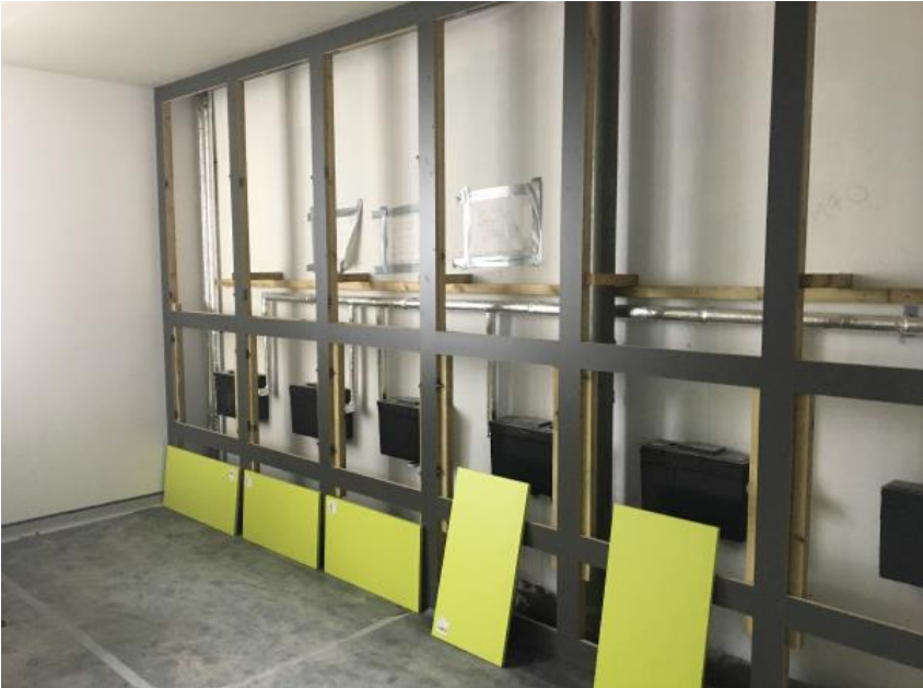
Secondary WCs Colour