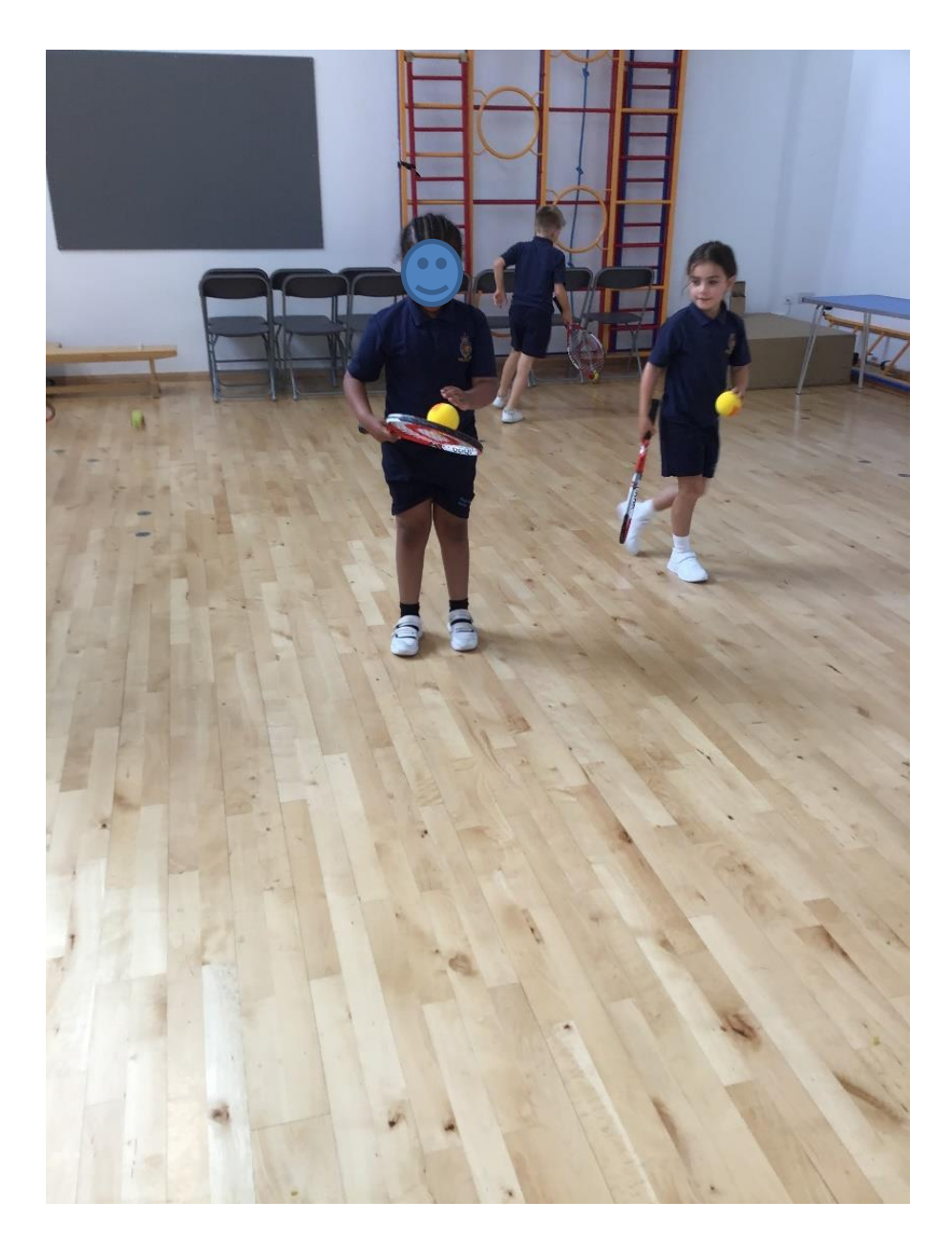
Opportunity and Success on a Global Stage