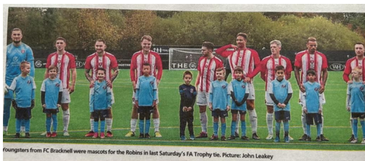
Youngsters from FC Bracknell were mascots for the Robins in last Saturday's FA Trophy tie.

Well done to all three boys for being part of such a big public event, and what a fantastic experience!